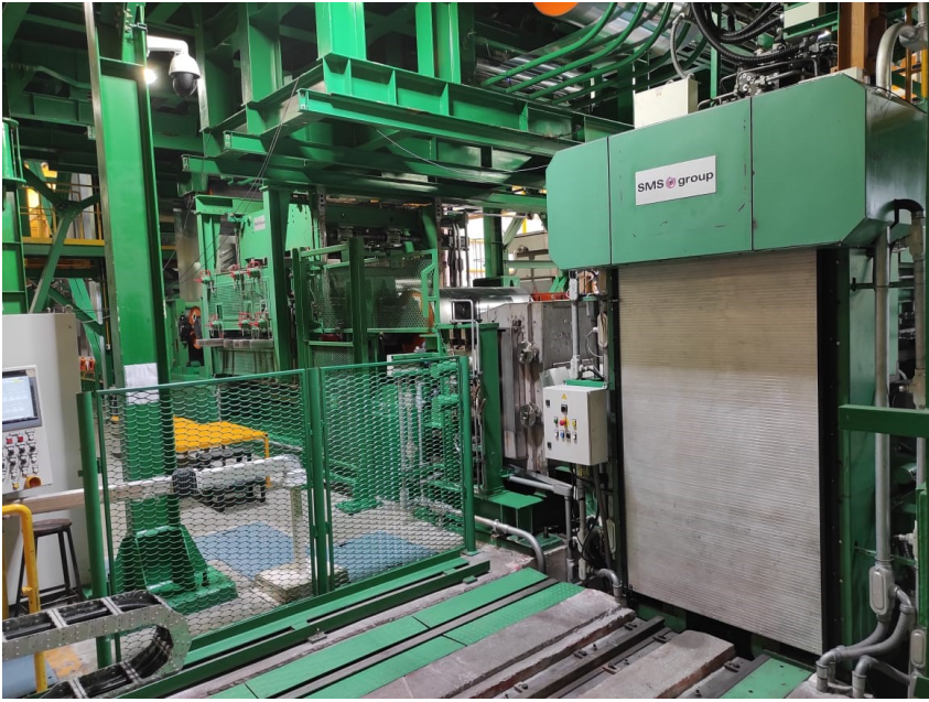
The inline skin-pass mill.