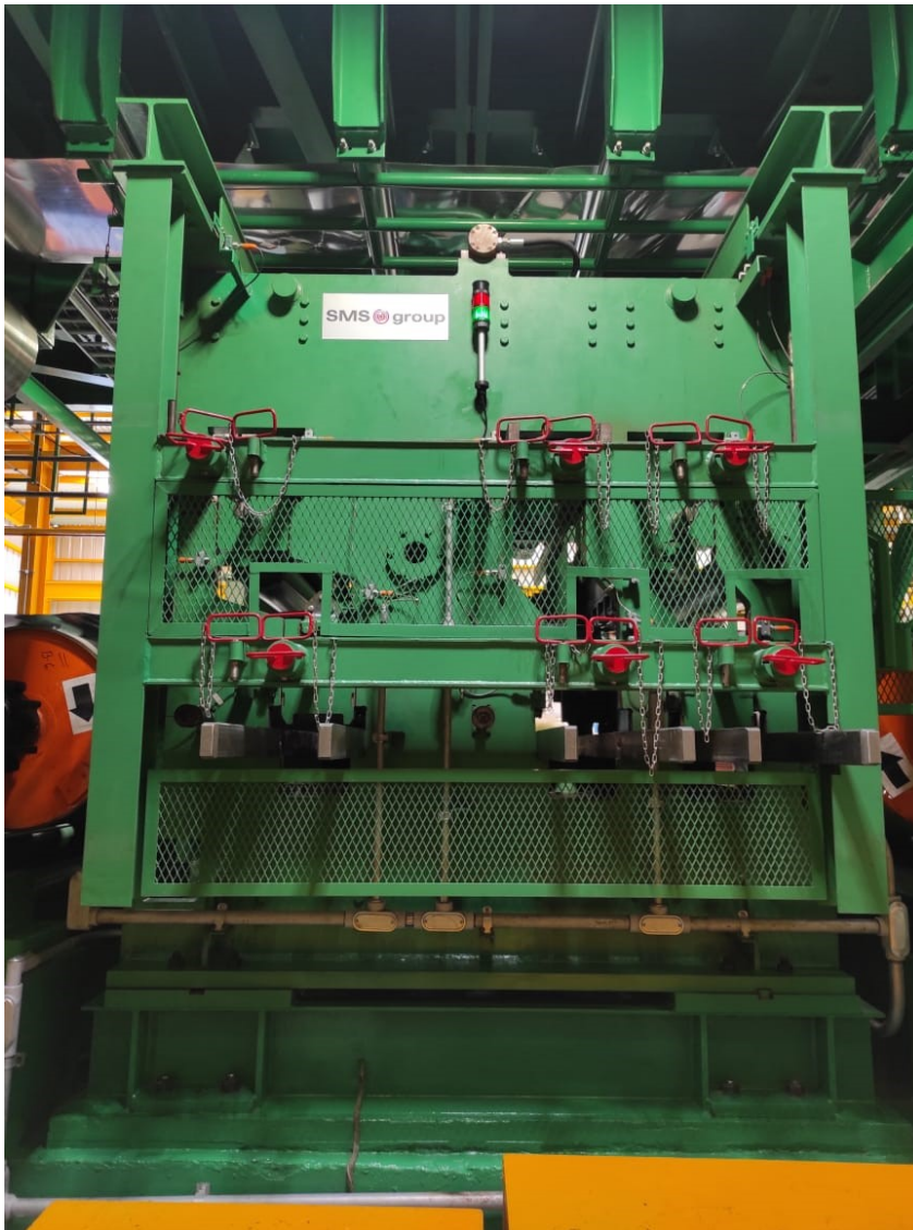
The tension leveler.

SMS group is a group of companies internationally active in plant construction and mechanical engineering for the steel and nonferrous metals industry. It has some 14,000 employees who generate worldwide sales of more than EUR 2.9 billion. The sole owner of the holding company SMS GmbH is the Familie Weiss Foundation.