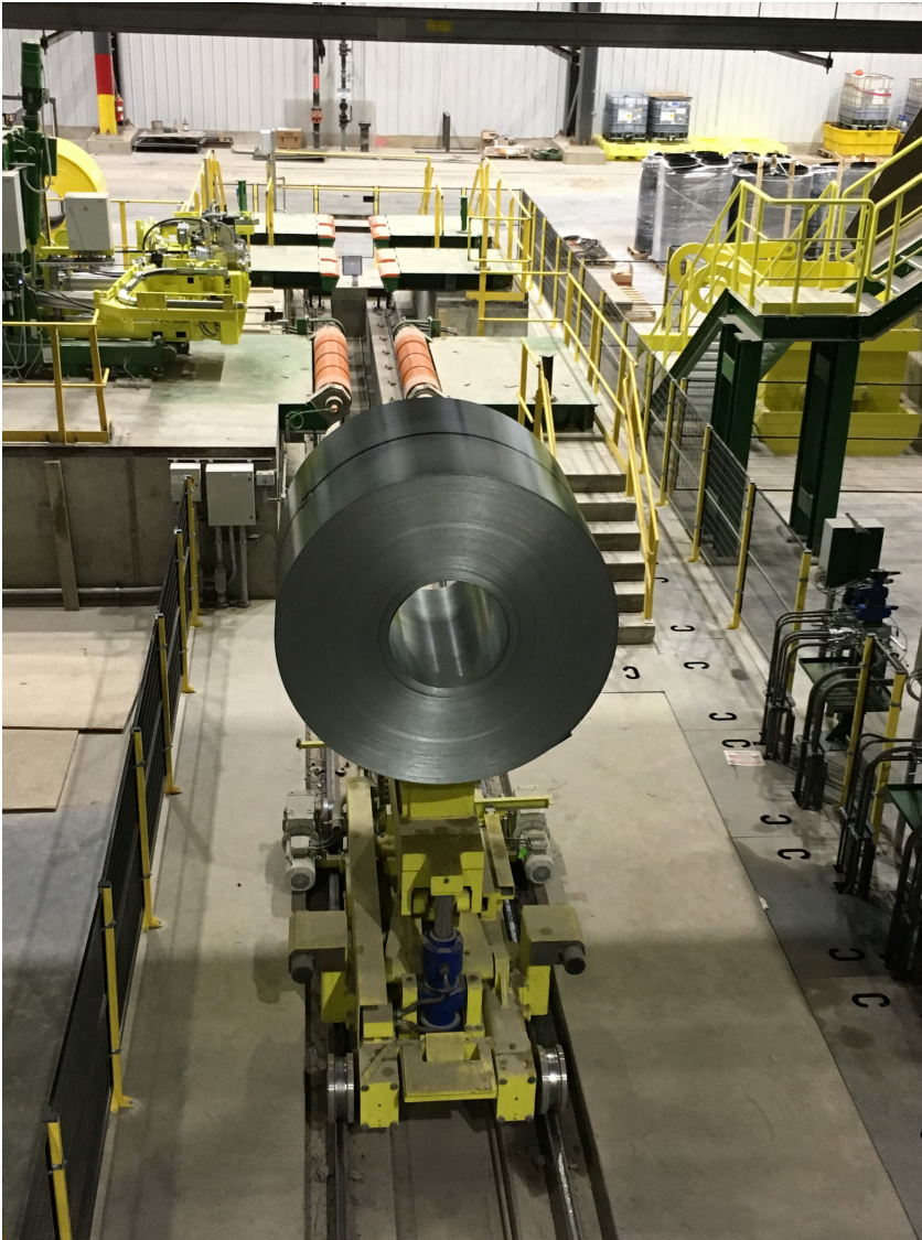
The first pickled and galvanized hot strip coil in September 2019.

SMS group is a group of companies internationally active in plant construction and mechanical engineering for the steel and nonferrous metals industry. It has some 14,000 employees who generate worldwide sales of more than EUR 2.8 billion. The sole owner of the holding company SMS GmbH is the Familie Weiss Foundation.